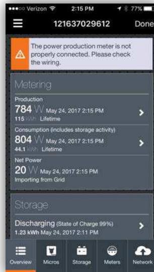
Enphase Installer's CT Toolkit

The Enphase Installer Toolkit was used to configure the system. Initial configuration was completed using a cell phone wifi connection to the Envoy-S gateway. The error message indicating that the power production meter is not properly configured is a result of the installation on a 208 volt commercial system (instead of a 240 volt residential system).