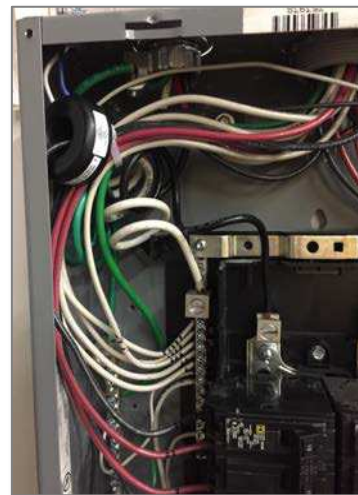
One Production Metering Current Transducer

Mounting and wiring the Envoy-S gateway was straightforward once the proper L1 wires were identified, and the leads from the Production CT were extended.