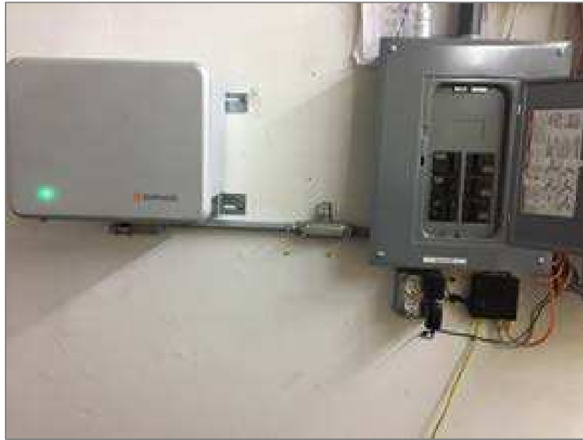
Enphase AC Battery Installed Near Subpanel

Two Consumption Metering current transducers (CTs) were installed on two of the three incoming AC power legs L1 and L2 so that net building energy usage could be monitored. Because there was limited space for these CTs, one of them was installed in the opposite direction. Since the current flow from this CT would therefore be negative, the leads were reversed when attached to the Envoy-S Metered gateway. One Production Metering CT is also installed on L1 from the microinverter (or other inverter) supply leg so that solar power generation can be monitored. Since this subpanel was about 25 feet away from the main panel (where the Envoy-S was installed), the leads from the Production CT were extended.