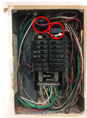
Two Consumption Metering Current Transducers in Service Panel