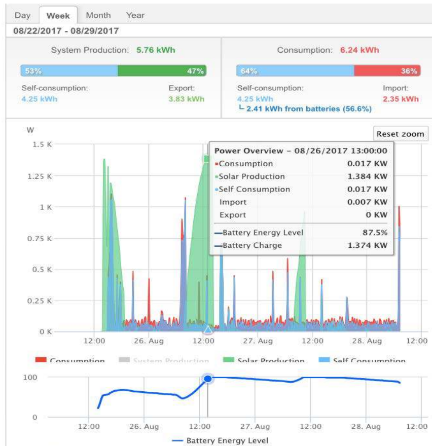
SolarEdge Monitoring Platform

Once cellular communications to the SolarEdge Monitoring Platform was completed the performance of the system could be viewed remotely, including total building consumption, solar production, self-consumption, power import from the utility, power export to the utility and battery status. System operating profiles can be set by the contractor on the SolarEdge Monitoring Platform. These profiles can establish optimal charge/discharge times so that customers can charge from PV or the grid when rates are low, and discharge the battery to the home when rates are high.