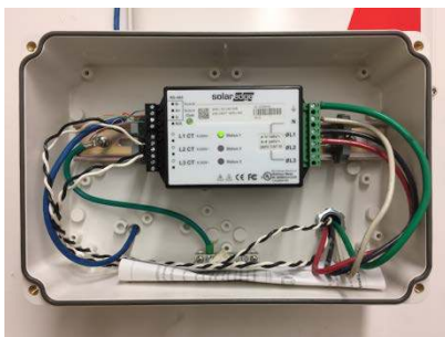
SolarEdge Electricity Meter

The SolarEdge Electricity Meter was mounted adjacent to the service panel for the building. Two Consumption Metering current transducers (CTs) were installed on two of the three incoming AC power legs L1 and L2 so that net building energy usage could be monitored. The meter was connected to a circuit breaker making sure that L1 and L2 corresponded to the same legs as those on the CTs. A CAT5 cable was connected to the meter communications pins in the inverter.